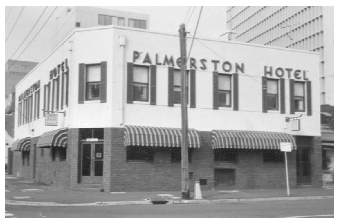
Palmerston Hotel, 1981